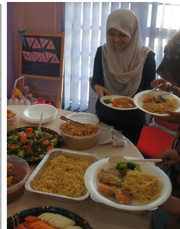
* Aluminium Foil Tray with cover - RM 8 per unit (Full), RM 4.00 (Half)